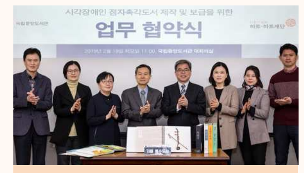
Partnership with the National Library of Korea for Special Books Project