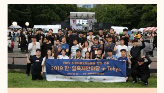
Heart to Heart Orchestra performance in Japan