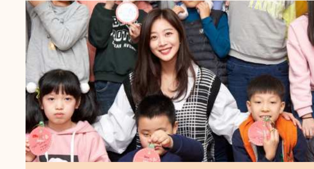
Campaign to support children from multi-cultural families