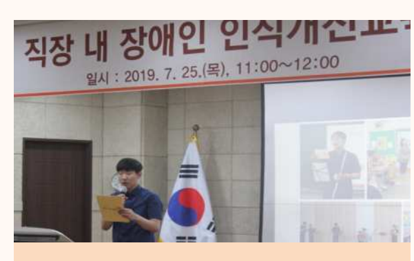
Job creation through disability awareness instructors